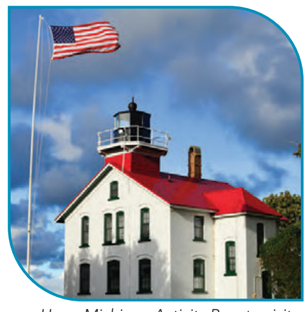
Use a Michigan Activity Pass to visit the Grand Traverse Lighthouse in Leelanau State Park.