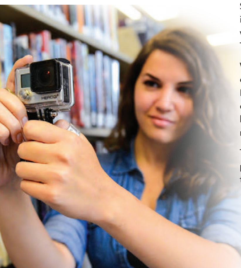
A GoPro Camera kit is one of our most popular Library of Things items.

The Library of Things has been hugely popular, as patrons discover the fun and value of borrowing these items instead of purchasing them.